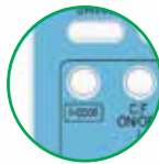
i-COOL AC & Fan one touch