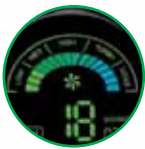
5 Speed Instant Cooling

S12SPD5 (1.0 Tr) - Rs.23990/- , S18SPD5 (1.5 Tr) - Rs.29490/- S09SPD3 (0.8 Tr) - Rs.15990/- , S12SPD3 (1.0 Tr) - Rs.20240/- S18SPD3 (1.5 Tr) - Rs.25240/- , S24SPD2 (2.0 Tr) - Rs.30490/-